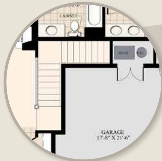
Alternate Floor Plan with Staircase to Optional Floor