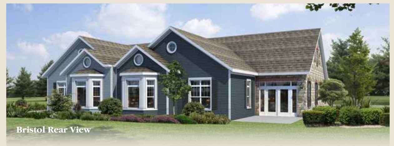
Bristol Rear View

The Bristol Twin Cottages at Heritage Village offer all of the beauty and space of free-standing cottages, but are two identical cottages joined at one wall. An open floor plan features a master bedroom suite and large second bedroom, both located at the rear of the dwelling. Each twin has two full baths, laundry area with washer and dryer, and a beautiful family/living room that opens into a custom kitchen that includes stainless steel appliances, wall oven, cooktop stove, built in microwave, garbage disposal, and large refrigerator/freezer. This home also features a covered front porch and rear patio that can be enclosed.