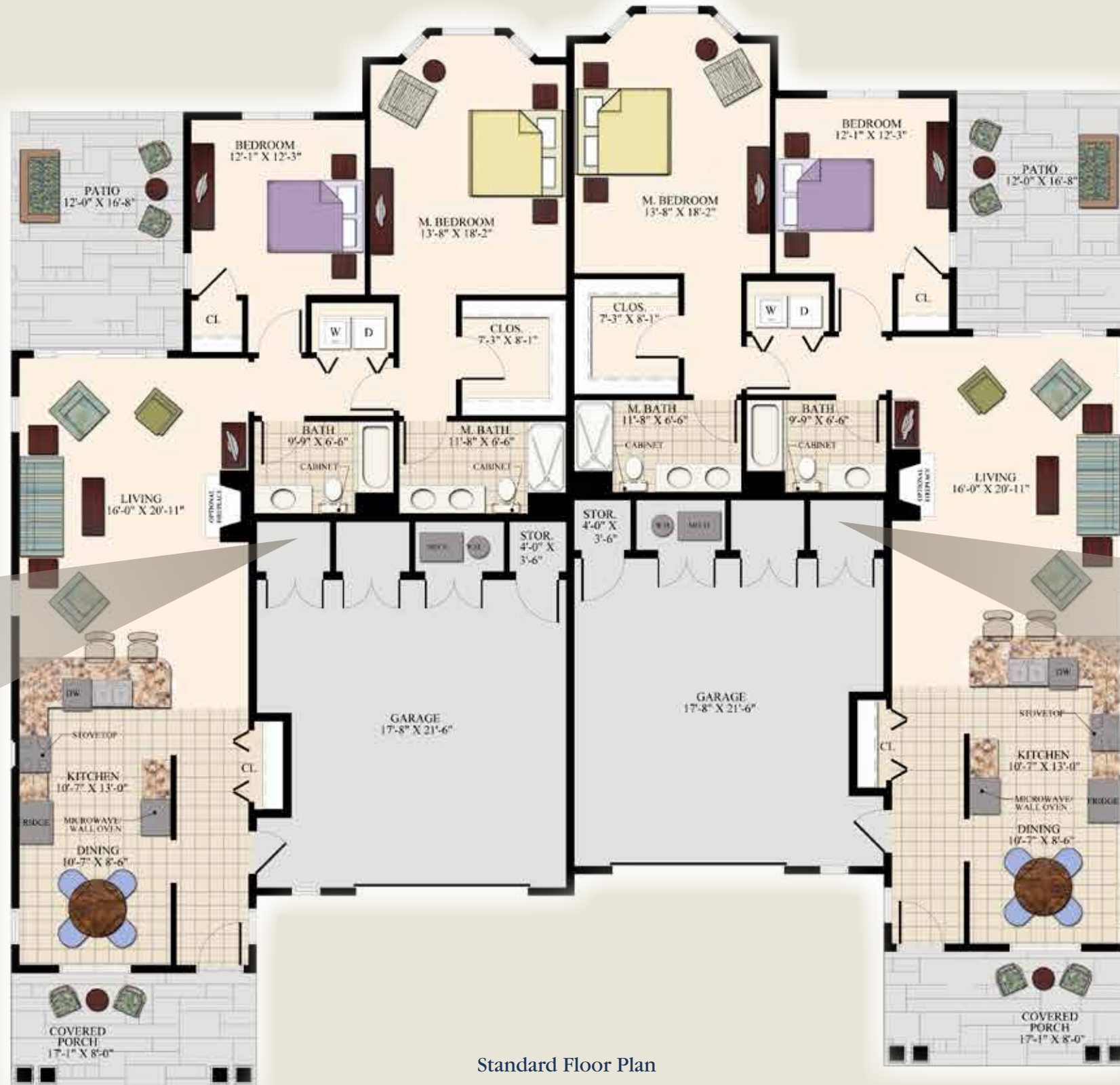
Standard Floor Plan