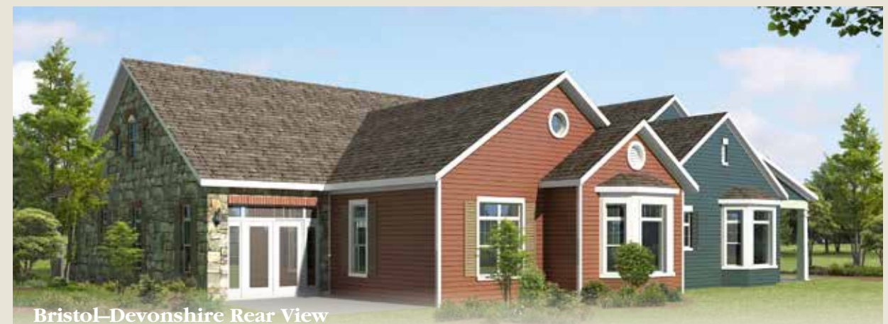
Bristol-Devonshire Rear View

The Devonshire-Bristol Twin Cottages offer all of the beauty and space of free-standing cottages, but are two different cottages joined at one wall. Both twin cottages feature different floor plans that offer large master bedroom suites, second bedrooms, two full baths, and laundry areas with washer and dryer. Each home has a large living room that opens into a custom kitchen that includes stainless steel appliances, wall oven, cooktop stove, built in microwave, garbage disposal and large refrigerator/freezer. This home also features a covered front porch and a rear patio that can be enclosed.