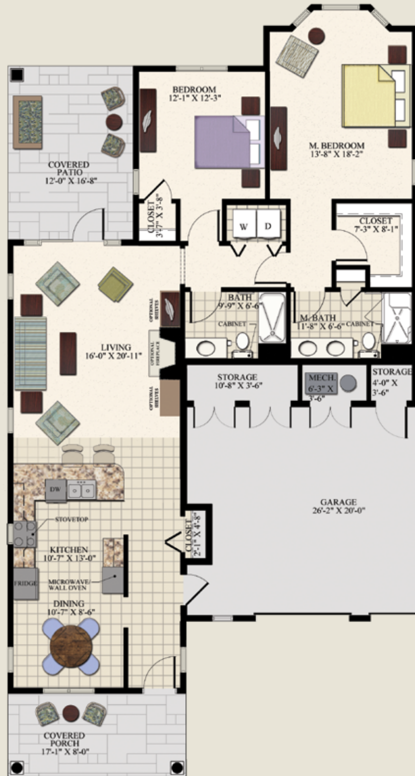
Standard Floor Plan