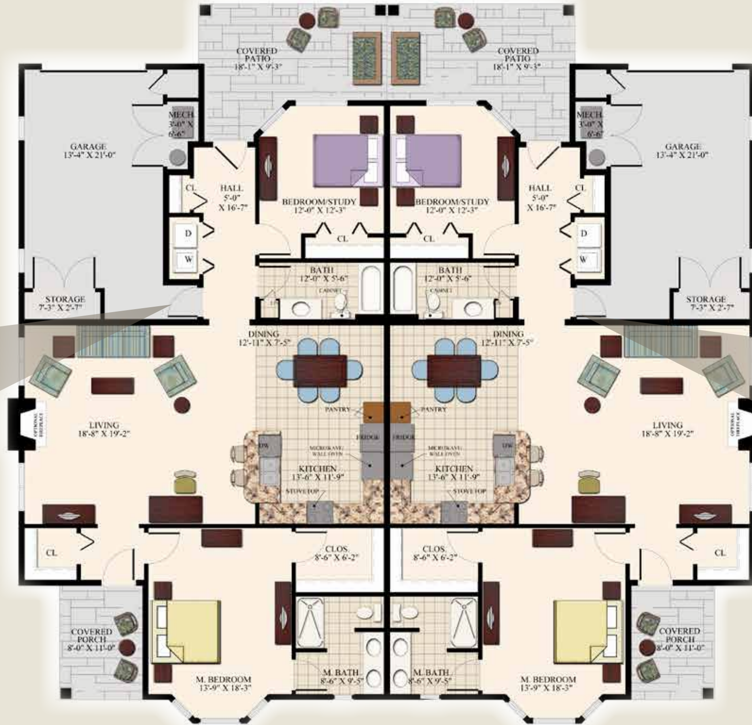
Standard Floor Plan