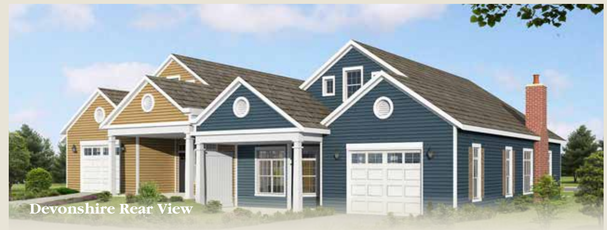
Devonshire Rear View

The Devonshire Twin Cottages at Heritage Village offer all of the beauty and space of free-standing cottages, but are two identical cottages joined at one wall. An open floor plan features a front master bedroom suite and a large second bedroom at rear. Each twin has two full baths, laundry area with washer and dryer, and a beautiful family/living room that opens into a custom kitchen that includes stainless steel appliances, wall oven, cooktop stove, built in microwave, garbage disposal, and large refrigerator/freezer. This home also features a covered front porch and rear patio that can be enclosed.